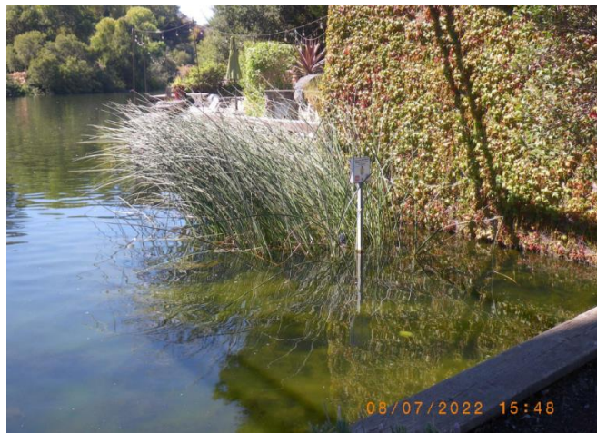
Figure 2. Tule bed growth progress under the Railroad Trestle in 2022, five years following the initial planting project.

To reinforce the tule bed habitat following the severe storms of January 2023, the City organized a second planting project for spring of 2023. In May 2023, the City contracted with Ecological Concerns, Inc. (ECI) to source and plant tules under the Railroad Trestle (Figure 3). With permission from KSCO NewsTalk Radio staff, ECI sourced the tules from Corcoran Lagoon by entering the lagoon from an access point near the radio station. The tules were planted by ECI on May 25, 2023, after water levels in Soquel Creek allowed for easy access to the streambanks. Today, the tule beds under the Railroad Trestle have persisted and continue to provide good habitat cover for fish species.