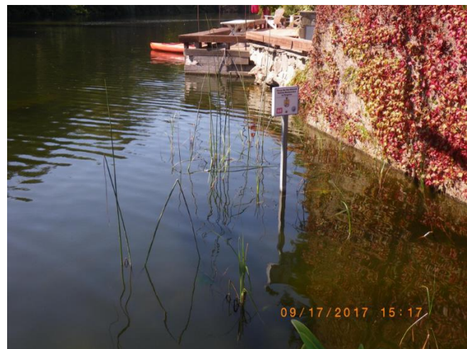
Figure 1. Tule planting and establishment under the Railroad Trestle in Soquel Creek in 2017.