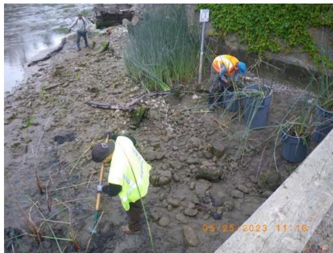
Figure 3. Replanting of tules by ECI habitat restoration staff in May 2023, following the severe January 2023 storms.

To reinforce the tule bed habitat following the severe storms of January 2023, the City organized a second planting project for spring of 2023. In May 2023, the City contracted with Ecological Concerns, Inc. (ECI) to source and plant tules under the Railroad Trestle (Figure 3). With permission from KSCO NewsTalk Radio staff, ECI sourced the tules from Corcoran Lagoon by entering the lagoon from an access point near the radio station. The tules were planted by ECI on May 25, 2023, after water levels in Soquel Creek allowed for easy access to the streambanks. Today, the tule beds under the Railroad Trestle have persisted and continue to provide good habitat cover for fish species.