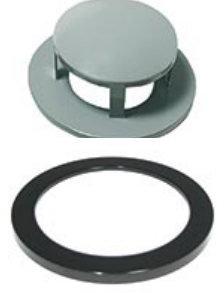
Oversized Opening Lid