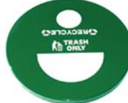
Split Trash/Recycle Lid