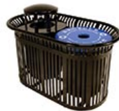
Midtown Dual Recycle/Litter Receptacle