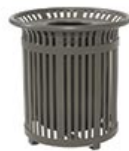
Midtown Litter Receptacle