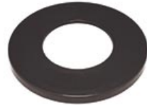
Flat Round Lid