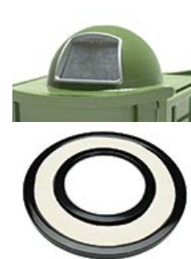
Ash Moat Lid