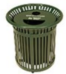
Midtown Split Recycle And Trash Receptacle