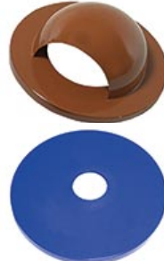
Recycle Flat Lid