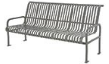
Midtown Bench With Back