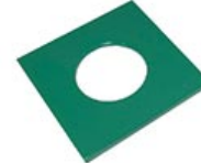
Flat Square Lid