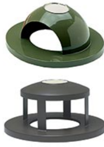
Elevated Ash Lid