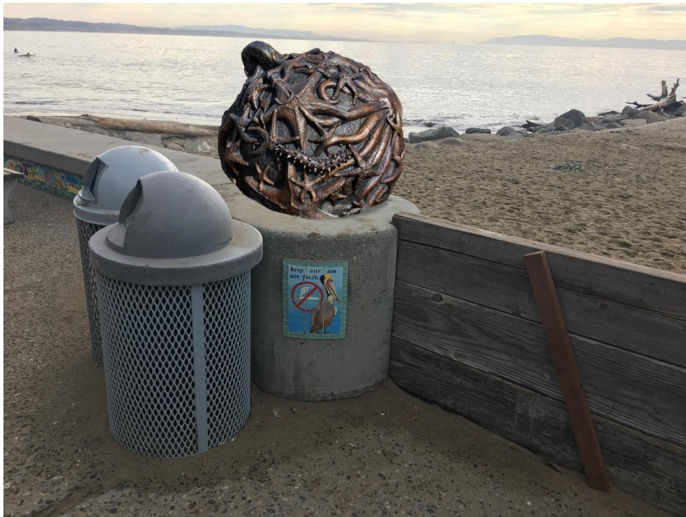
Star Fish Ball