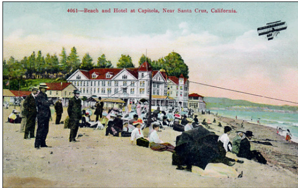
Capitola Beach, circa 1910

Deeds. The County Records Office has these. You can research the chain of title yourself or you can hire a title company to do it for you.