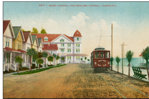
Capitola Hotel and streetcar, circa 1910

The Capitola Branch Library , 2005 Wharf Road, Capitola, has books on local history and is part of the Santa Cruz Public Library System. Materials from other branches are available through interlibrary loan. (This branch scheduled to re-open in 2020.)