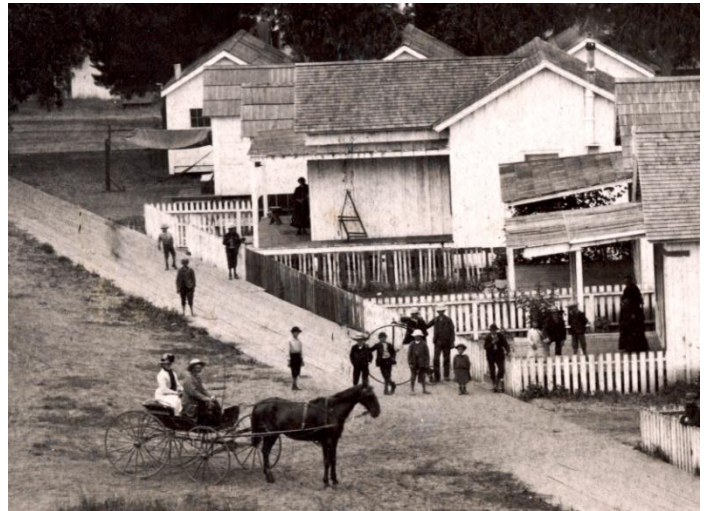
High-wheeling through Capitola. The roads may have been dirt, but the sidewalks were redwood in this 1880s view of Monterey Avenue. Note the high-wheel bicycle.

Soquel Pioneers: three books on local history