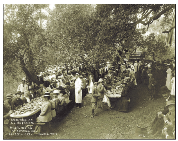
Picnic on the Pacific Cove Property in 1912

In contrast, a hotel pays both property taxes and a hotel tax equal to 10 percent of the hotel's receipts. Using data from comparable hotels in Capitola, an 80-