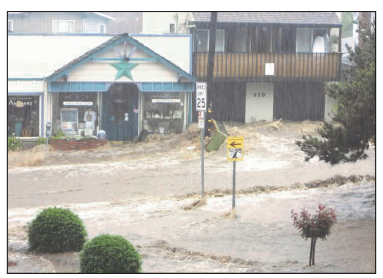
View from City Hall during 2011 flood