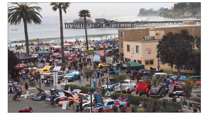
"The 10th Annual Capitola Rod & Custom Classic will be held June 6-7.