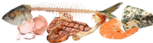
Cooked meats & dairy / Carnes cocidas y lácteos