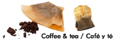
Coffee & tea / Café y té