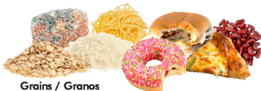
Grains / Granos