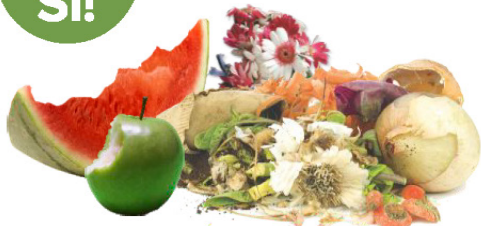
Fruits & vegetables / Frutas y verduras

Please put food scraps in your green cart to be composted. Coloque los restos de comida en su carrito verde para que se conviertan en abono.