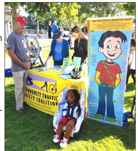
The Community Traffic Safety Coalition encouraged vehicle safety for children at last year's event

National Night Out is a great opportunity to bring neighbors and public safety organizations together in a relaxed and positive environment. Join us!