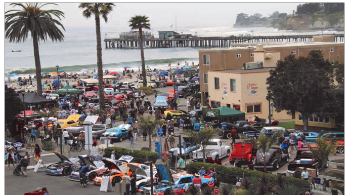
"The 10th Annual Capitola Rod & Custom Classic will be held June 6-7."