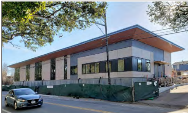
The new library building, from Clares Street

The new Capitola Library Branch is nearing completion! The City hopes that construction will be complete and the building ready to “hand over” to the Santa Cruz Public Library (SCPL) system in late April. SCPL operates all library branches within the County outside of those in Watsonville. The opening of the library to the public is dependent on restrictions due to the pandemic, but there is hope that by mid-summer the building will be open for at least limited services. A virtual Grand Opening will likely be held in Summer 2021.