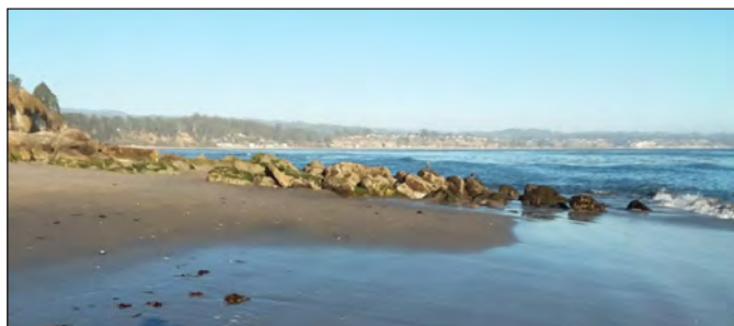
The Jetty before

The next key project is widening and rehabilitating Capitola Wharf to improve its resilience. The City is in the midst of acquiring the necessary permits, with construction scheduled for next winter and spring. The project includes widening the narrow section at the start of the wharf, improving the utilities, and re-decking the structure so that Capitola maintains a lasting Wharf for all to enjoy.