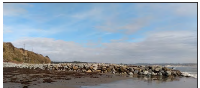
The Jetty after, December 2020