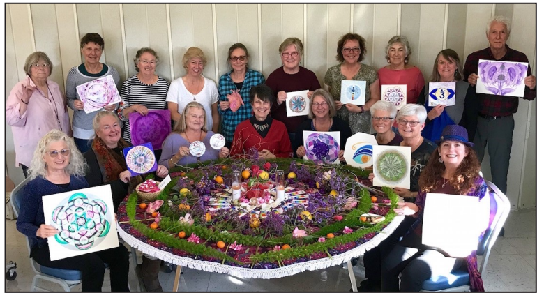
A Mandala class in the Community Center