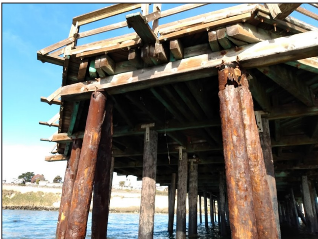
Pilings before, in need of repair

The next phase of improvements are scheduled for Fall 2022 and include widening the narrow part of the wharf, utility improvements, and re-decking the surface of the wharf. Funding for these improvements come from the voter approved Measure F, state grants, and the American Rescue Plan.