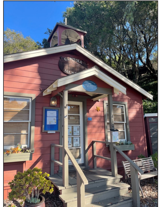
The museum, pictured in January 2022