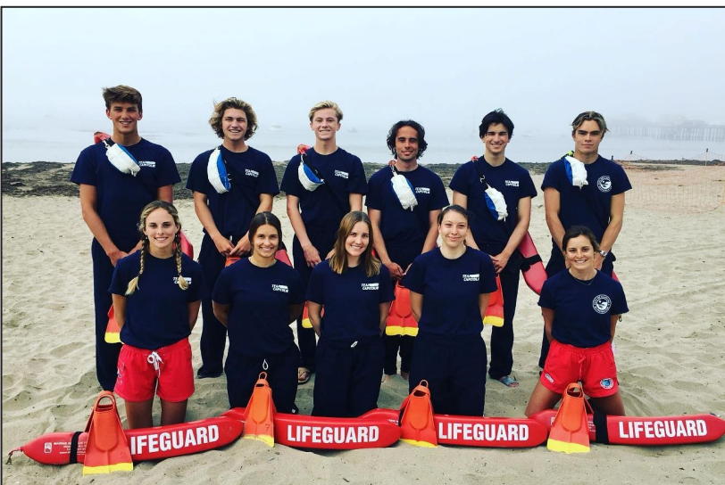
Previous Junior Guard Instructors on Capitola Beach

Some exciting new classes include youth programming provided by the National Academy of Athletics, as well as gymnastics classes.