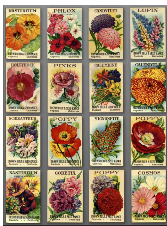
Brown Ranch Seed Packet Poster

Visit the Historical Museum Thursdays through Sundays from noon to 4 P.M.