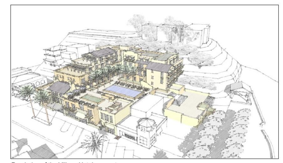
Rendering of the Village Hotel concept

The City received a conceptual review application for a future hotel at 120 Monterey Avenue, previous home to the Capitola theater and current parking lot. Swenson Builders, the property owner, seeks feedback from the Planning Commission and City Council on a conceptual design for an 89-room hotel including meeting and banquet space, a bar/ lounge open to the public, a pool on the second story, and 92 onsite parking spaces within an underground parking garage. The design reinforces the Village's pedestrian-oriented development pattern with storefront windows facing the sidewalk on Monterey Avenue. The building height is two and three stories