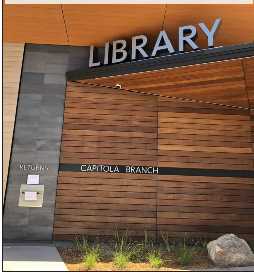
Capitola Library's book drop and entrance.

Thank you to the Friends of the Capitola Branch Library and all Library sponsors!