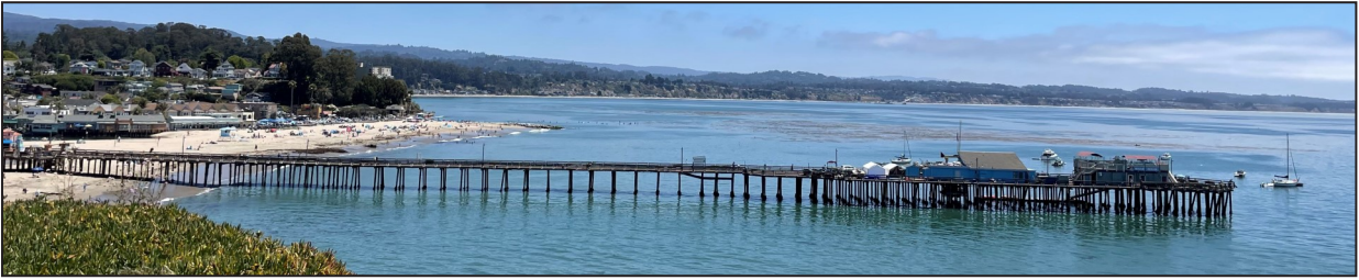
Rehabilitation of Capitola Wharf to begin in summer/fall.

On July 22, 2021, City Council approved the first phase of improvements to Capitola Wharf. This initial project will repair steel piles along the outer end of the wharf and make structural repairs around the Wharf House Restaurant. Construction bids are due to be received in late August and construction should be completed this winter.