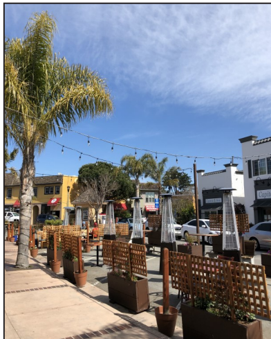
Temporary outdoor dining in the Village.