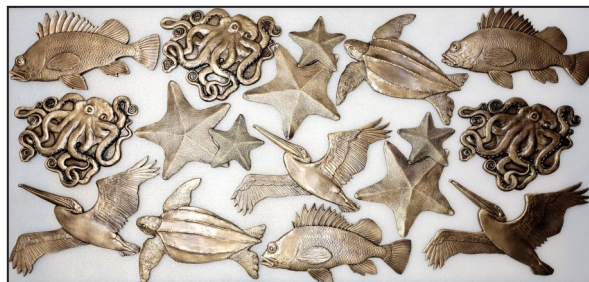
Bronze sea and coastal animals will be installed in the Wharf deck.

The City is happy to announce that bronze marine-life art pieces, generously funded by community donations made through the Capitola Wharf Enhancement Project, will soon be installed in the Wharf