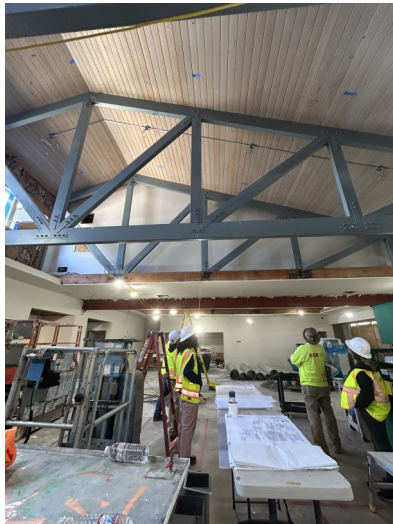
New trusses in the Community Center ceiling.