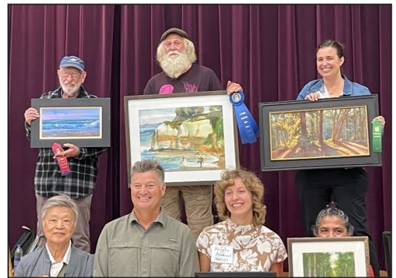
2024 Plein Air winners with their art pieces.

The City, with the Art & Cultural Commission, is thrilled to host the 10 th annual Capitola Plein Air event November 3-9, 2025! This celebrated occasion invites talented artists to capture the charm and beauty of Capitola's coastal landscapes, historic architecture, and lively village