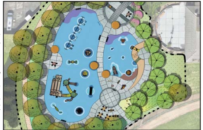
Jade Street Park Universal Playground Design Concept

While the estimated project costs are $1.8 million, the City's current project funding is $475,000. To bridge this funding gap, the City is thrilled to be partnered with the Friends of County Parks for a fundraising campaign. The Friends have pledged a $1 million fundraising goal in private gifts from the community. For more information on the campaign, and to donate, please visit https://www.countyparkfriends.org/jadestpark . Fundraising efforts are expected to run through January 2025. City staff plans to seek Council approval of project plans, specifications, and the final cost estimate when the fundraising campaign has met 75% of the $1 million target goal.