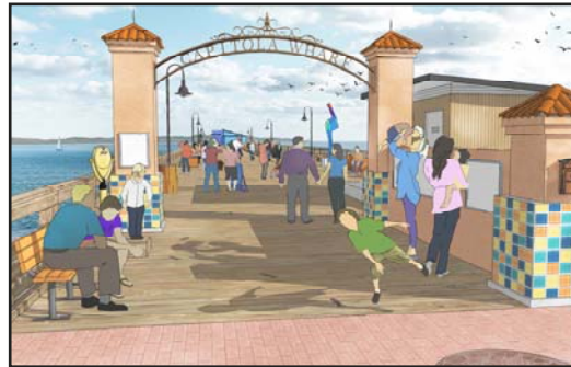
CWEP preliminary design concept

Now, the CWEP team of community volunteers are leading a campaign to raise funds towards these enhancements. Thanks to a partnership with Wharf to Wharf Race, some money has already been raised, but more public support means even more enhancements for all to enjoy. Donations are accepted online or via check, and more info can be found online at https://capitolavillage.com/wharf/ . Together, we can breathe new life into the Capitola Wharf!