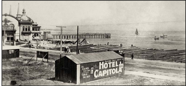
A sign advertising Hotel Capitola near Santa Cruz Casino and Pleasure Pier, 1907

The first advertising billboards appeared along American roadway in the 1830s on the sides of barns and fences. With the increase in automobiles in the 1920’s, the placement of stand-alone billboards along highways gained in popularity because they could capture the attention of passing motorists. To be effective, billboard ads had to be brief and highly graphic. A favorite image in our current exhibition is the Hotel Capitola sign placed under the nose of the competition at the Santa Cruz Beach Boardwalk. Some billboards were truly works of art. In the 1920s, local sign maker Leo Sievert made many large-scale advertising signs for the Capitola nightclub the Hawaiian Gardens. Many of these appeared on the side of downtown Soquel buildings, directing visitors to Capitola. Stop by our current exhibition to see several of Sievert’s colorful prototypes of these larger advertising signs. The admission free Capitola Historical Museum, 410 Capitola Ave, is open Fri-Sun from noon until 4:00pm.