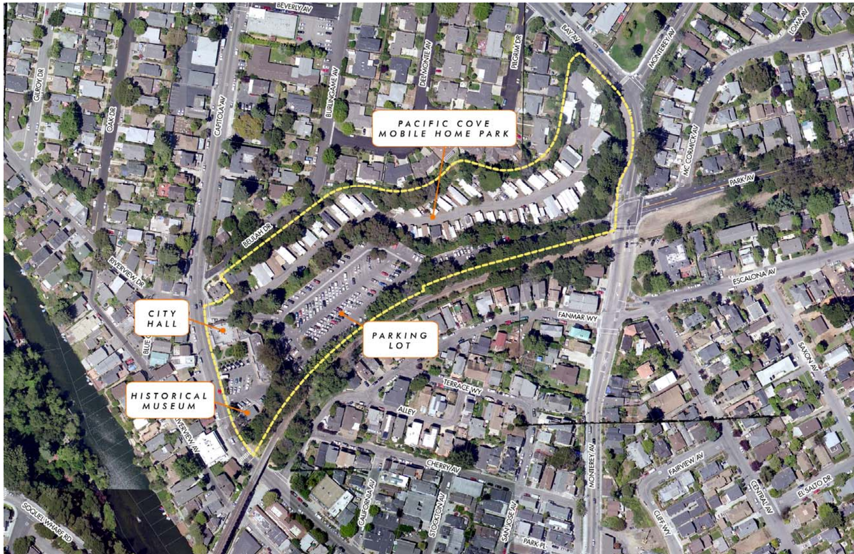
FIGURE 1 SITE BOUNDARIES