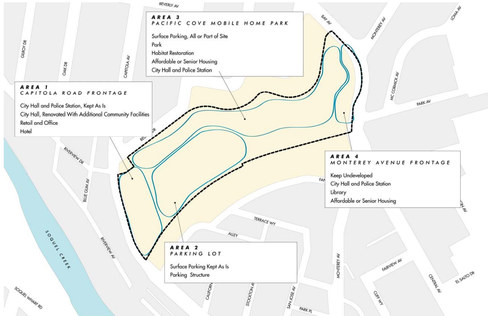
FIGURE 6 SITE POSSIBILITIES