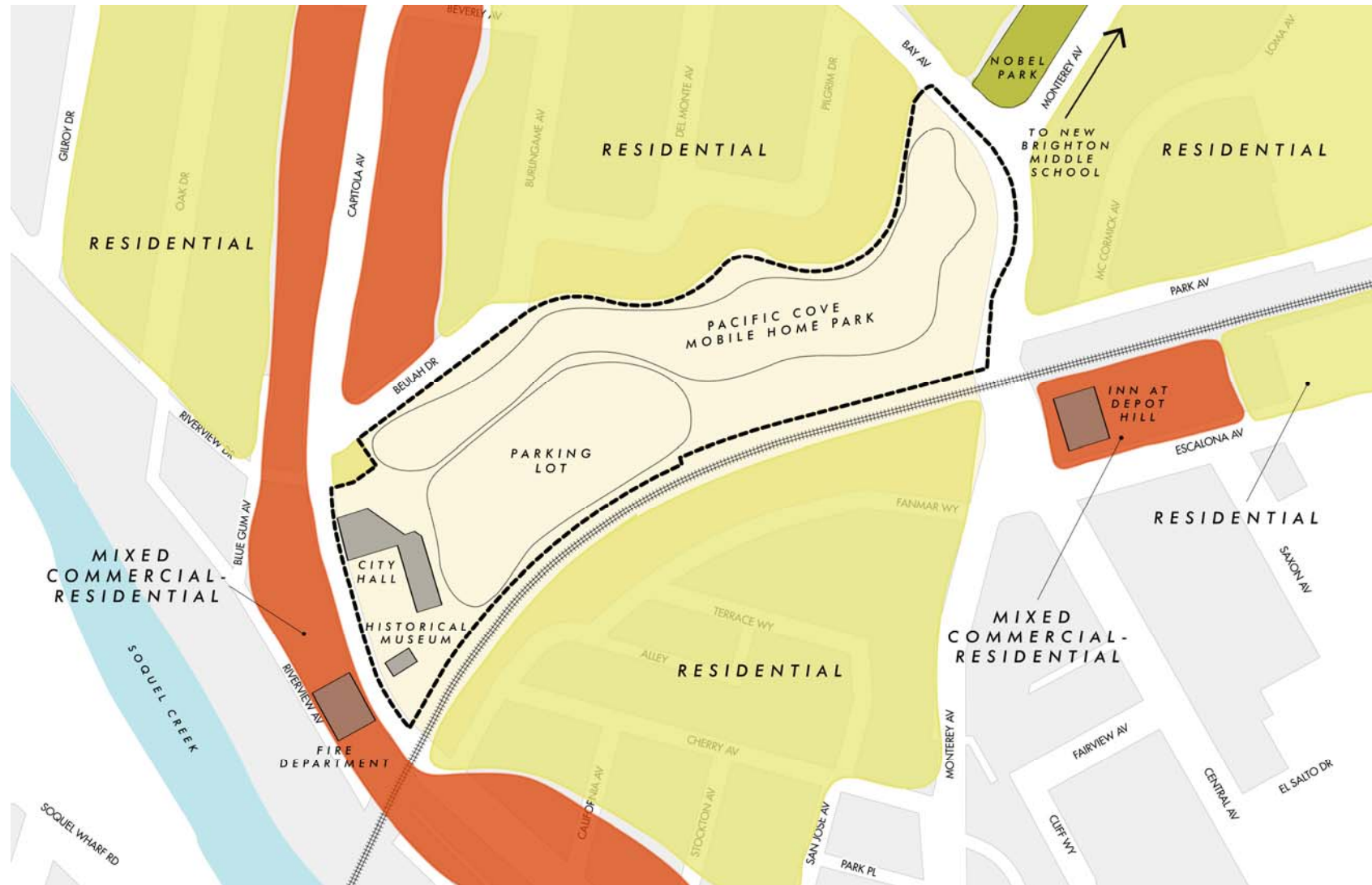
FIGURE 2 EXISTING LAND USES