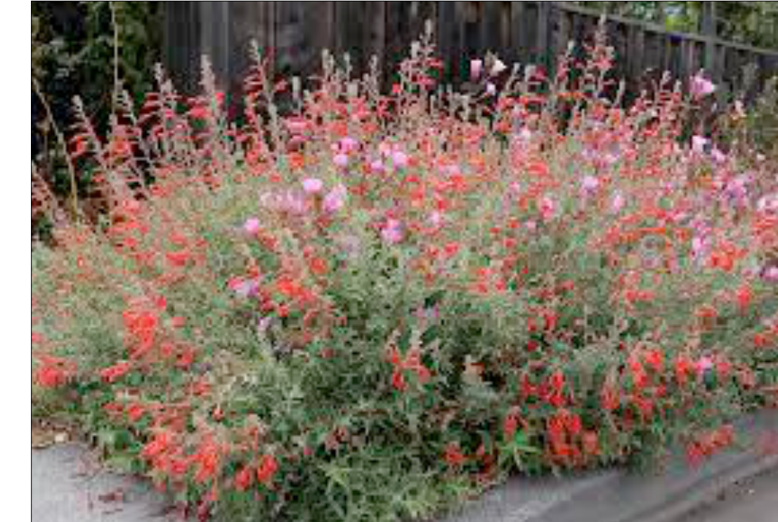
CALIFORNIA FUSCHIA M (1 GAL.)