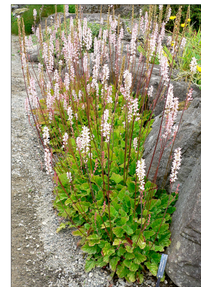
MAIDEN'S WREATH (FRANCOA SONCHIFOLIA) M (1 GAL.)