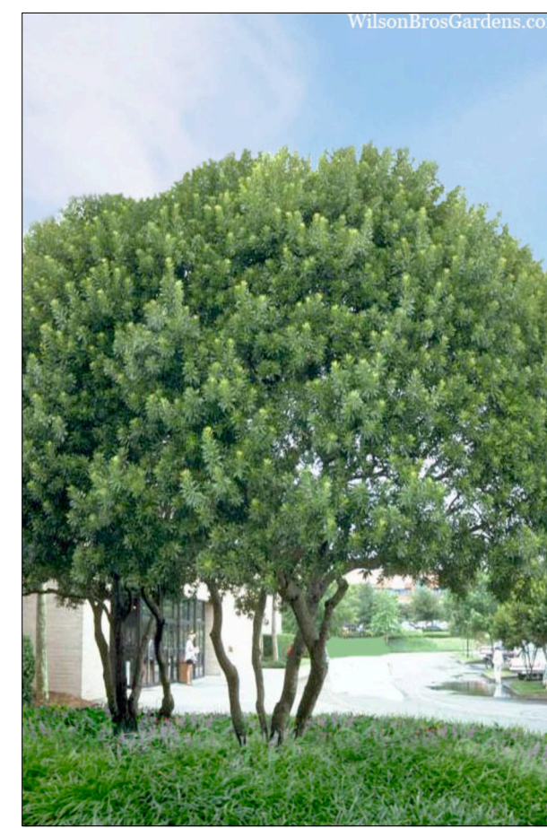
WAX MYRTLE TREE (20') CANOPY (MYRICA CERIFERA)