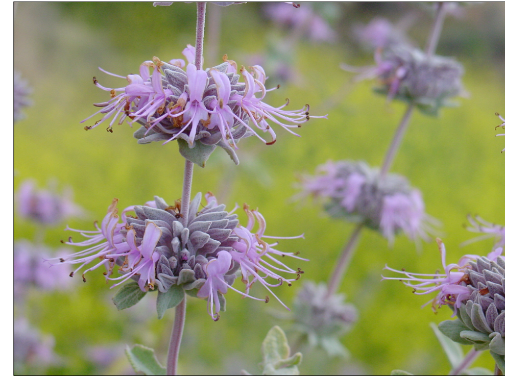
GROUND COVER LANDSCAPING PURPLE SAGE (SALVIA LEUCOPHYLLA)